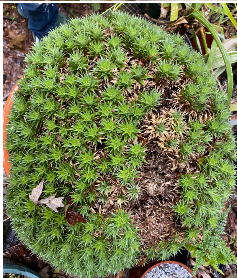
Counterclockwise from top: Tillandsia capitata 'Maroon', Nidularium rutilans , and Deuterocohnia brevitata ; the central chasm is the result of a fallen tree limb.

Opposite page, left to right, top to bottom: Aechmea fasciata variegata; Orthophytum (lemei x gurkenii) x harleyi; Billbergia 'Bruddah Iz'; B. 'Domingos Martins' x 'Pom-Pom'; Vriesea ('Sunset' x 'Eva') x 'Hotspot'; mutant Neoregelia flower; Quesnelia 'Tim Plowman'; N. 'Big O' x 'Razzy'; N. 'Tune Up' x 'Jem'; N. 'Caviar' x 'Razzy'; Orthophytum 'Mother Lode' x harleyi; N. 'Chipotle' x 'Big O', Sincoregelia 'Plum Crazy'; N. 'Crazy Rabbit' ; N. 'Donna' ; N. 'Hannibal Lector' x smithii; B. Domingos Martins' x 'Fantasia'; B. 'Domingos Martins' x 'Fantasia'; N. 'Maggie's Pride' ; N. 'Massasauga' ; N. 'Perfect Harmony' x ('Small Wonder' x 'Treasure Chest'); N. 'Red Hot Embers' ; N. 'Sam Smith' ; N. smithii hybrids; N. smithii x 'Painted Lady'